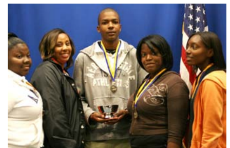
Clinton High 2 nd place winner