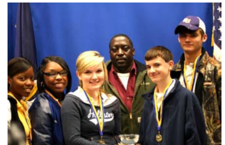
West Feliciana High 1 st place winner