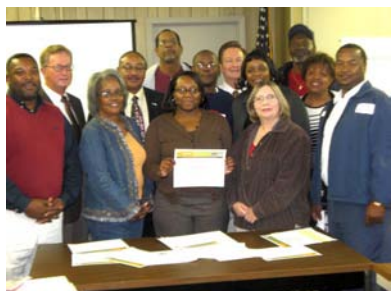
LEAD certificate award