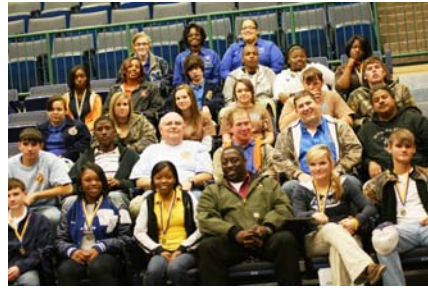
All five participating schools pose with teachers and SU Ag Center event coordinators