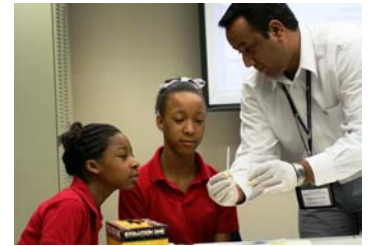
Hands-on demonstration on disease identification

More than 100 professionals, students, scientists and community members interested in the health and safety of plants attended the symposium.