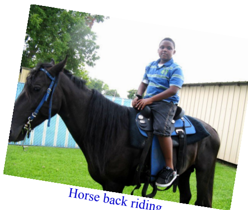
Horse back riding