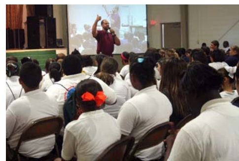
"Tha Hip-Hop Doc" addresses students

To read the full story, please visit the Daily World at: http://www.dailyworld.com/article/20100822/NEWS01/8220307/Young-people-get-the-message