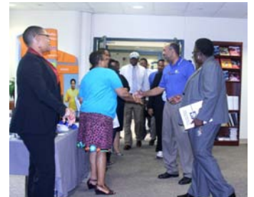
Mason views Extension posters