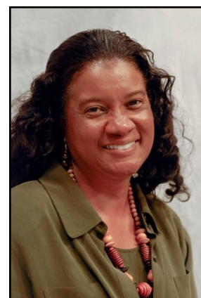
Gibson, current participant

To read the full story, please visit the link: http://www.usda.gov/wps/portal/usda/usdahome?content-only=true&contentid=2010/08/0405.xml