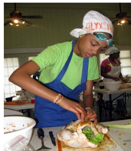
Student practices stuffing chicken