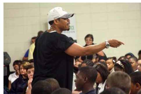
"Doctor Truth" addresses audience