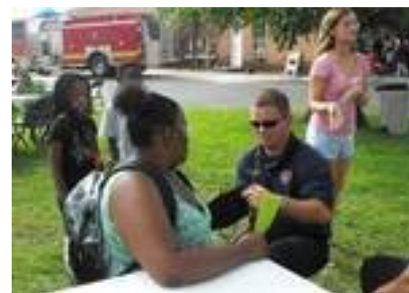
Blood pressure exam and face-painting