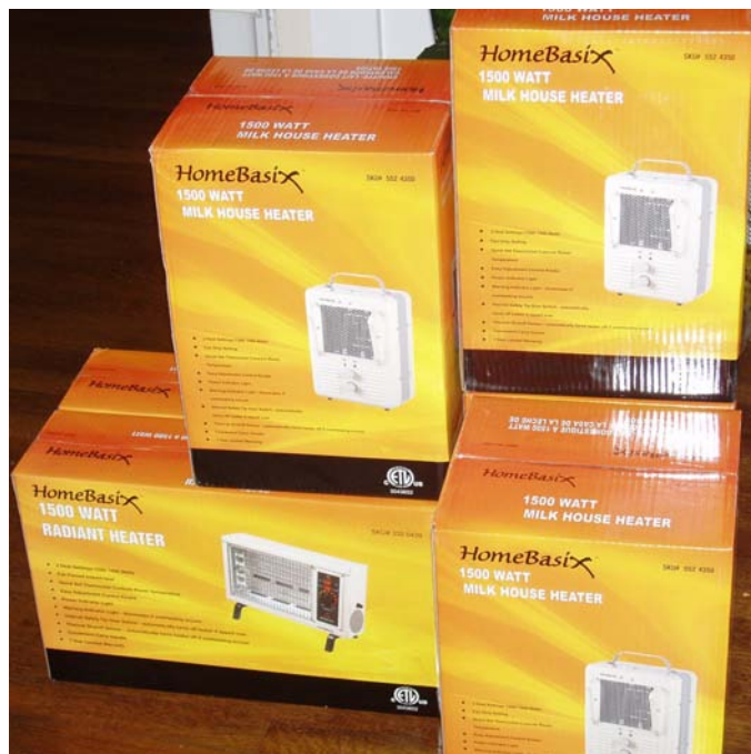
Heaters distributed to the needy in three parishes

An act of kindness can go a long way in strengthening community relationships. Through this act, the Southwest Center has been asked to partner with a variety of home health care providers to assist in educating clients on family and human development.