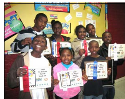
Cookery contest Winners