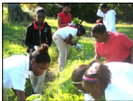
Youth garden harvest

Youth Educational Support (Y.E.S.) students participated in St. Helena 4-H Cookery contest and did an outstanding job preparing their dishes. There were 25 youth participants in the contest.