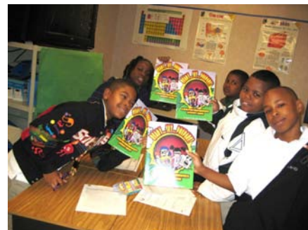
Youth learn emergency preparedness