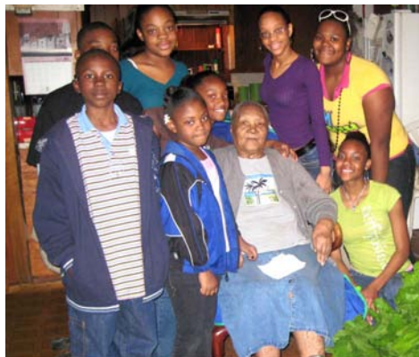
Youth spread holiday cheer

St. Helena Central Elementary students also learned basic emergency skills and how to react when faced with fires, floods, hurricanes, tornadoes, explosions, warning signals, fallout protection, terrorism attacks, and other emergency situations. A total of 102 youth were reached in this project. The event was coordinated by Angela Myles, youth agent, St. Helena and Tangipahoa Parishes.