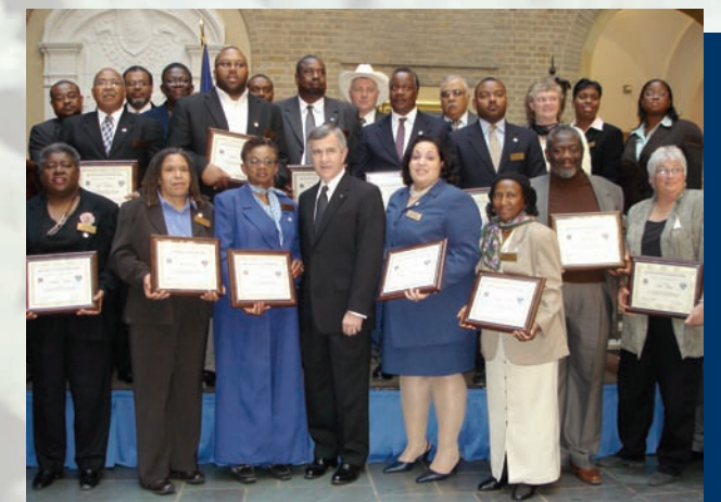
First institute graduating class with U.S. Department of Agriculture Secretary, The Honorable Mike Johanns.